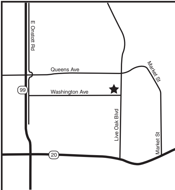
Yuba City Location 1408 Live Oak Blvd., Suite E Yuba City, CA 95991